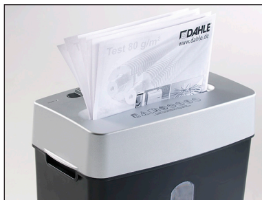
Built-in jam protection - Slide the switch to reverse motor if sheet capacity is exceeded.

Shreds credit cards, paper clips, & staples