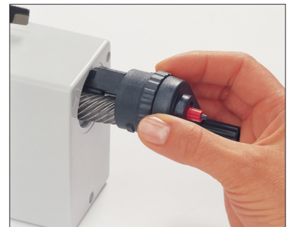
Automatic Cutting System pulls the pencil in to sharpen, then spins freely to prevent over-sharpening.