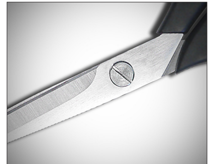
Blades are screw fastened and feature a double ground surface to cut through thicker materials.