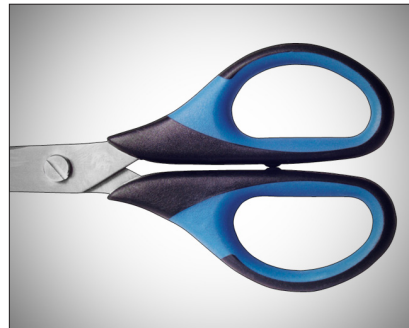
Soft cushioning is gentle on the hands and reduces fatigue when continually cutting.