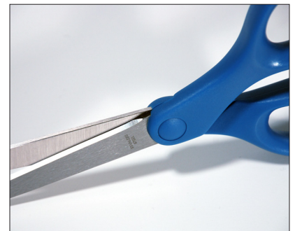
Stainless steel blades resist rust and maintain a sharp cutting edge.