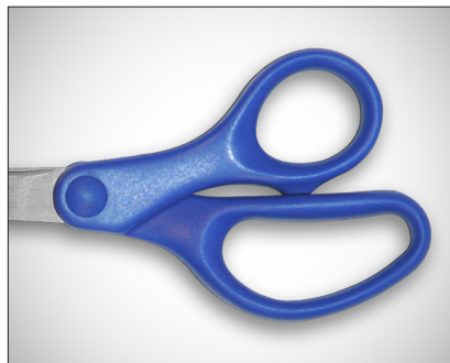
Contoured handles fit comfortably around your fingers and reduce fatigue.