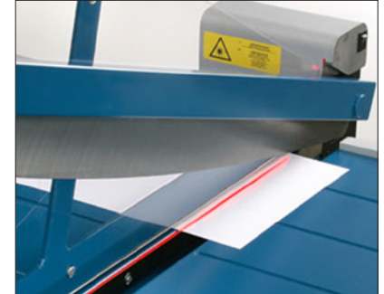
Optional laser guide ensures accuracy by illuminating the cut line across the entire cutting surface.