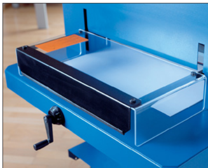
Built in safety covers on both sides of the blade prevent the blade from moving while up.