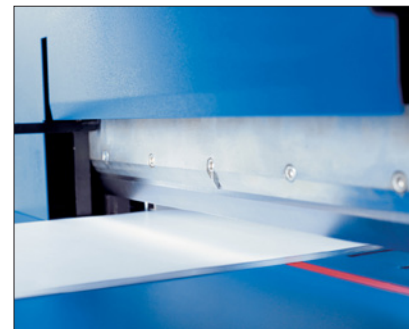
Ground Solingen steel blade cuts through up to 200 sheets of paper with ease.