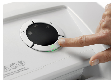
The easy-to-use command dial controls all shredder functions including power up, reverse, and continuous run.