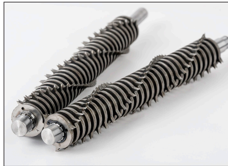
Aggressive cutting edges are fused to a steel shaft, creating an incredible bond and superior performance.