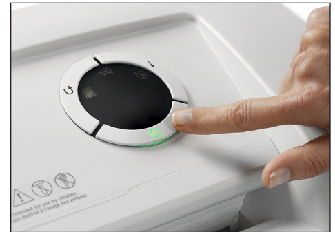
The easy-to-use command dial controls all shredder functions including power up, reverse, and continuous run.